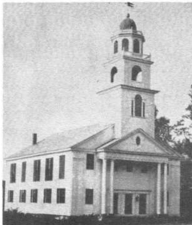
Westmoreland Town Hall

After I recovered from my surprise, I told her I needed to look at some of the old town records. The town clerk was not there, so she had me write down what I needed. Then she said, "You might want to look