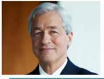
Jamie Dimon Chairman and Chief Executive Officer, JPMorgan Chase & Co.