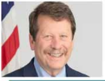
Dr. Robert M. Califf Commissioner of Food and Drugs, U.S. Food and Drug Administration