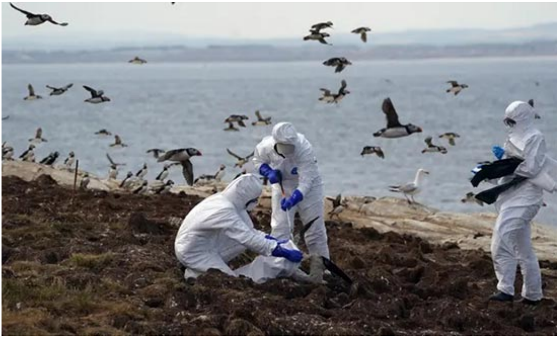
Bird flu outlook is 'grim' as new wave of the virus heads for Britain

“We’re not going to face that scenario, I don’t think, but if we allow an avian virus to which none of us has got any immunity to continue to circulate in birds and then increasingly, whether it’s minks or seals, come across into the mammalian sector and therefore start to adapt, there’s a risk there. You can’t quantify it. But we don’t have an H5N1 vaccine tomorrow ready to go.”